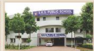
SKS Public School Raniganj