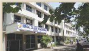
Bengal College of Engineering Durgapur