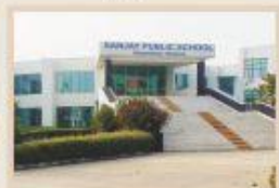
Sanjay Public School, Mathura