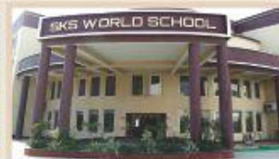
SKS World School Noida