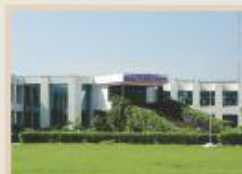
SKS Ayurvedic Medical College and Hospital, Mathura