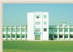
Sanjay Institute of Technology and Management, Mathura