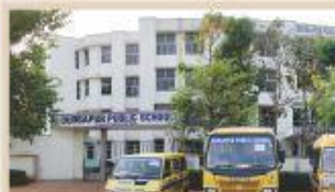
Durgapur Public School Durgapur