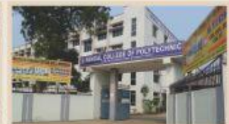
Bengal College of Polytechnic Durgapur