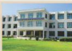
Sanjay College of Pharmacy Mathura