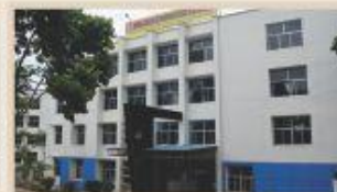
Bengal College of Pharmaceutical Sciences and Research, Durgapur