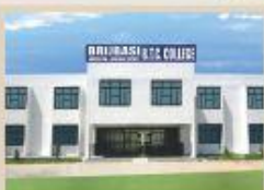
BEWS BTC College, Mathura