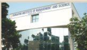
Durgapur Institute of Management and Science, Durgapur